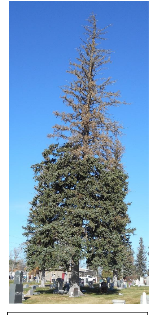
Spruce tend to die from the top down when attacked by ips beetle

However, care must be taken to prevent the spread of beetles from the tree that is cut down to living trees. Infested spruce wood with ips beetle larvae has the potential to produce adult beetles that can infest new