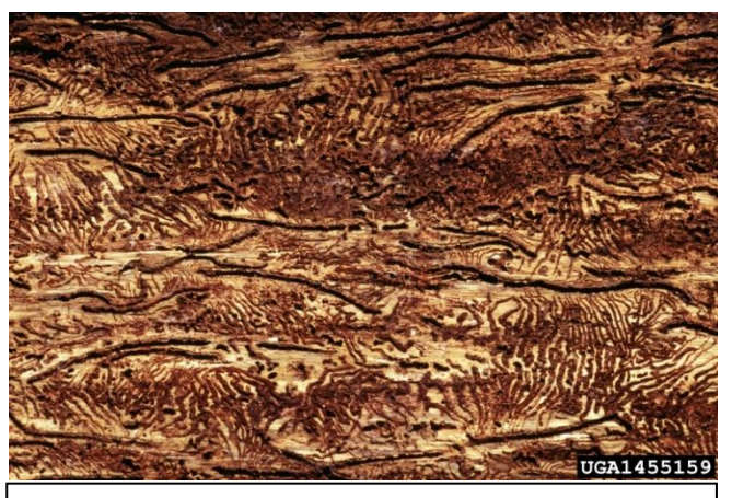
This is a typical tunneling pattern of the spruce ips beetle, also called a gallery.

Homeowners with spruce trees, especially older or stressed trees, may consider hiring an arborist to spray a preventative insecticide to the trunk and larger branches to prevent ips infestations. Be sure the arborist has the proper equipment to apply the insecticide to the very top of the tree. Two insecticide treatments, one in early spring and one in midsummer is generally recommended since ips beetles have multiple generations per year. Insecticides which contain the active ingredient permethrin, bifenthrin, or carbaryl have proven effective.